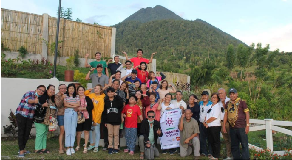
9.24.2022: RCKC Friendship and Fellowship Day at Glandang, Tupi, South Cotabato with the Rotakids