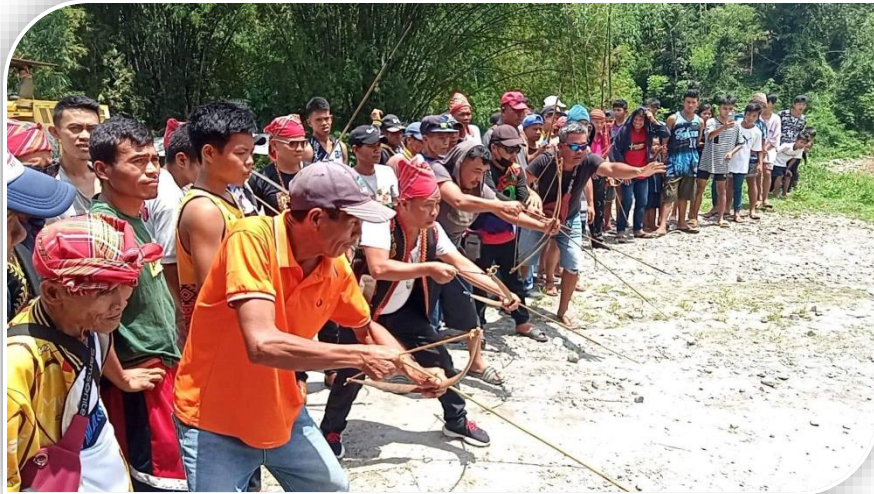
9.23.2022: Traditional Tribal Games during the Indigenous People's Day at Talcon, T'boli, South Cotabato