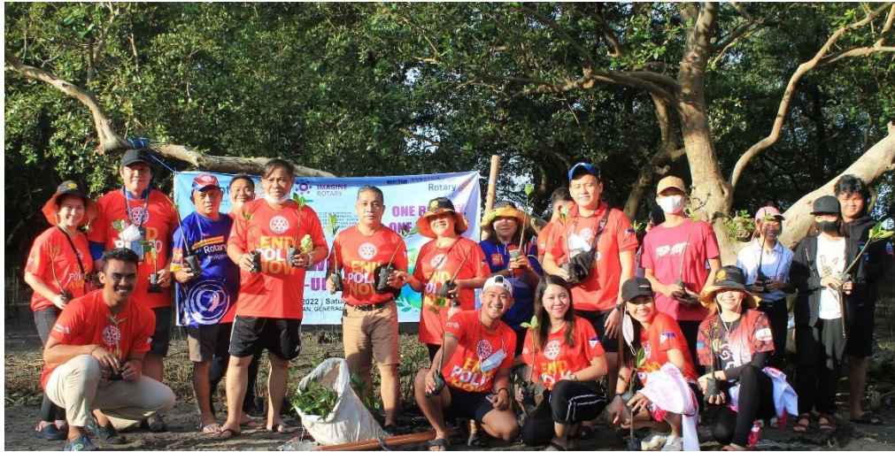
9.17.2022: Mangrove Growing and Coastal Cleanup at Sarif Mucsin, Barangay Baluan, General Santos City