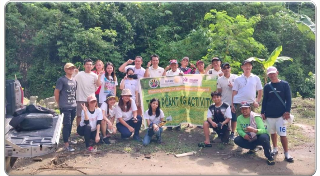
10.1.2022: Tree Planting Activity at El Gawel, Brgy. Saravia, City of Koronadal