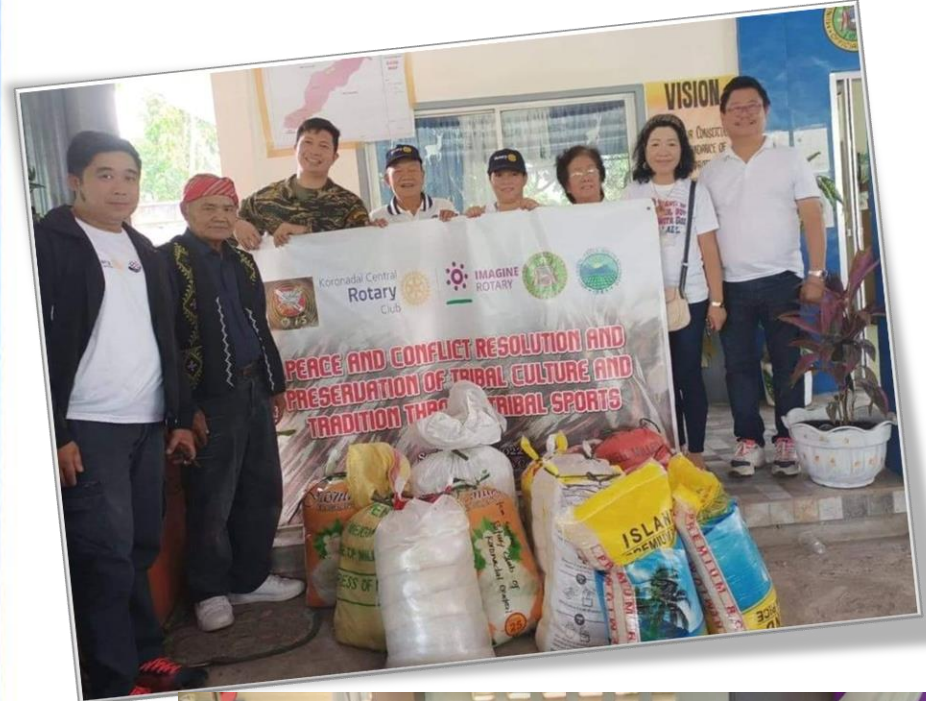
9.23.2022: Indigenous People's Day at Talcon, T'boli, South Cotabato